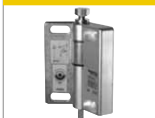
HINGE SAFETY SWITCH