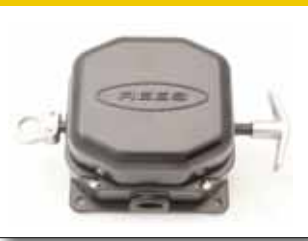
HEAVY DUTY (AVAILABLE: BLACK, YELLOW & WHITE)