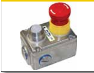
IP69K E-STOP CONTROL STATION W/DUAL COLOR STATUS LED