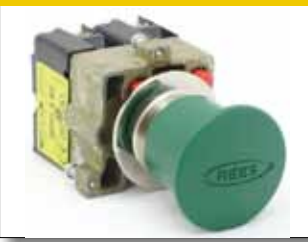
HEAVY DUTY 22MM PUSHBUTTON