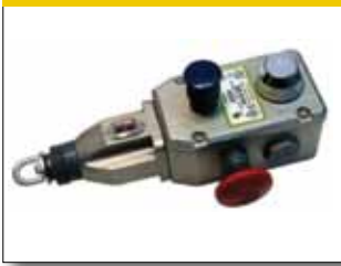
DUAL COLOR STATUS LED IP69K W/INTEGRATED E-STOP