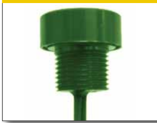
12MM ANODIZED ALUMINUM SWITCH