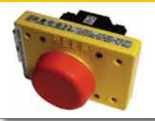
2.25" MUSHROOM PLUNGER – ROBUST W/LOCKOUT FEATURE