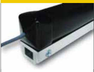
SAFETY EDGE - RANGE OF PROFILE SIZES