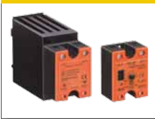
SOFT STARTERS, REVERSING CONTACTORS & BREAK RELAYS