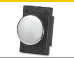
ROBUST LOW FORCE