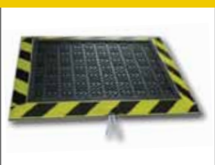
STANDARD & CUSTOM SIZE SAFETY MAT