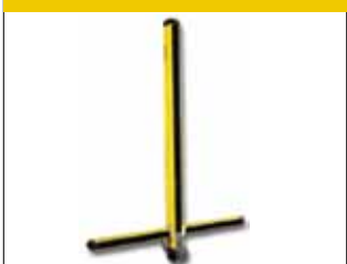
SAFETY MUTING LIGHT CURTAIN