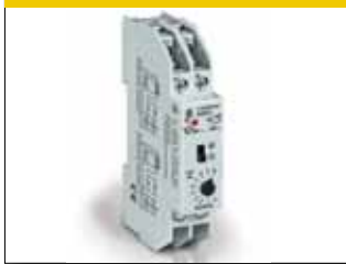
TIME & REMOTE SWITCHES & INSTALLATION ELECTRONICS