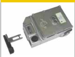
RFID GUARD LOCKING SWITCH