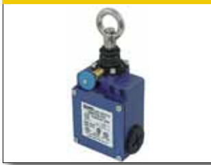
DURABLE COMPACT NON-METALLIC BODY IP65/67