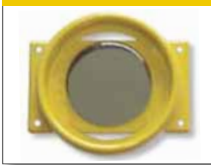
INTEGRATED RING GUARD