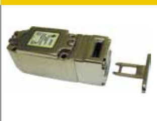
STAINLESS STEEL KEYED INTERLOCK SWITCH