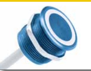
ANODIZED SWITCH WITH RING ILLUMINATION W/LED