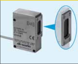
STAINLESS STEEL IP69K SENSORS