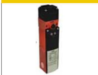
SOLENOID LATCHING KEYED INTERLOCK