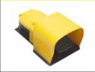
FOOT SWITCH WITH TOE GUARD