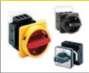
DISCONNECTS & ROTARY CAM SWITCHES