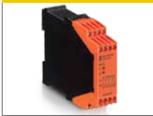
STANDARD & PROGRAMMABLE SAFETY RELAYS