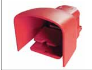
IP67 RATED METAL HOUSING