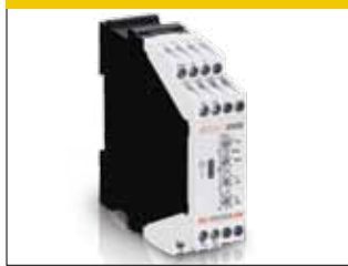
CURRENT, MONITORING & MEASURING RELAYS