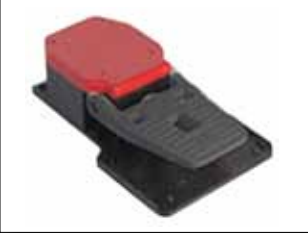
FOOT SWITCH CYCLE STOP