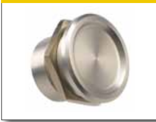
FINGER GUIDED STAINLESS STEEL SWITCH