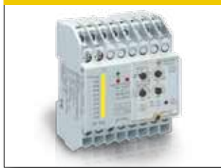
OVER/UNDER VOLTAGE - PHASE & MOTOR LOAD MONITORS