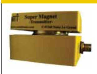
MAGNETIC LATCHING NON-CONTACT SAFETY SWITCH