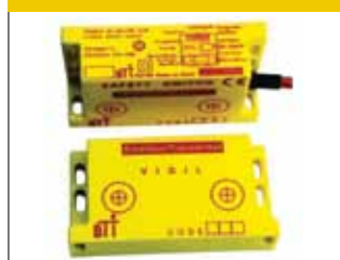
CAT 3 & 4 STAND ALONE SAFETY SWITCH