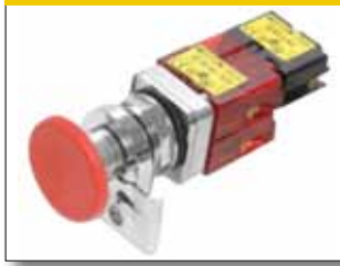
ROBUST 30MM WITH LOCKOUT/TAGOUT FEATURE