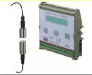
METAL DOUBLE SHEET DETECTION