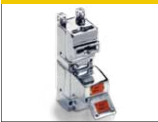
LOCKING MECHANICAL W/TRAPPED KEY