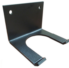
Fixed Height MAX Storage Hanger