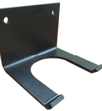
Adjustable MAX Storage Hanger