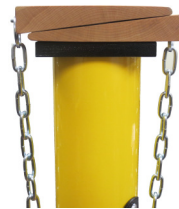
Hardwood Wedges for Fixed Height assemblies