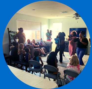
Connecting with the Core Team