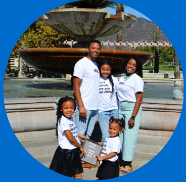
Inviting others to partner in bringing this vision to life.