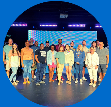
Connecting with other church planters from across the country at Stadia cohort in Georgia