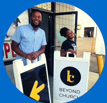
Picking up brand new signs from a Fontana designer