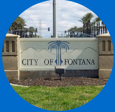
Giftng North Fontana and beyond a place to call home.

When we decide to be generous, we run the good risk of transforming our communities! Your gift of generosity extends and maximizes your investment in God's work both now and beyond.