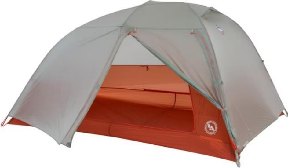
TENT GROUND FOOTPRINT