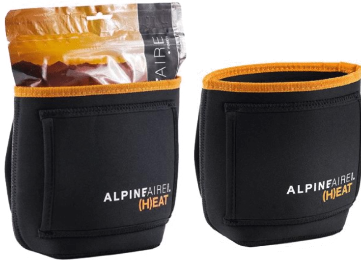
INSULATED FREEZE-DRIED FOOD POUCH