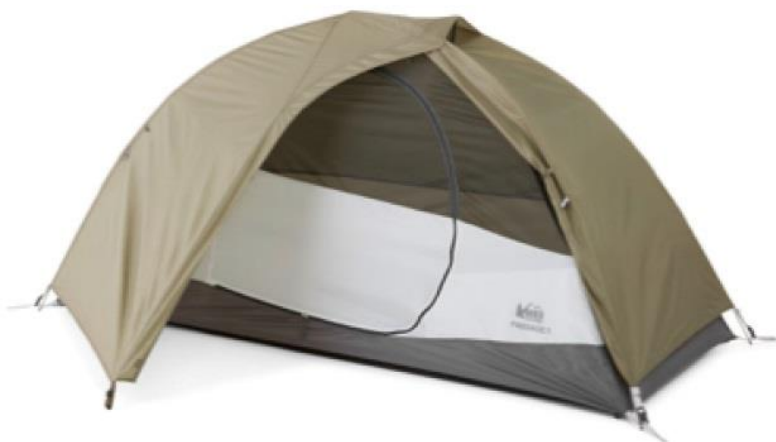
SELF SUPPORTIVE TENT WITH RAIN FLY (GROUND FOOTPRINT NOT SHOWN)