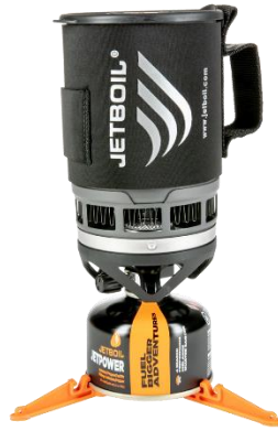
JET BOIL STOVE WITH FUEL CANNISTER