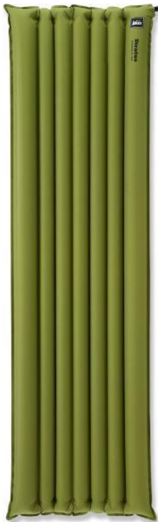
INFLATABLE SLEEPING PAD