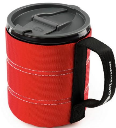
BACKPACKER COFFEE MUG