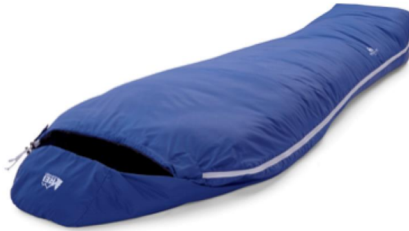
50F / 10C DEGREE SLEEPING BAG