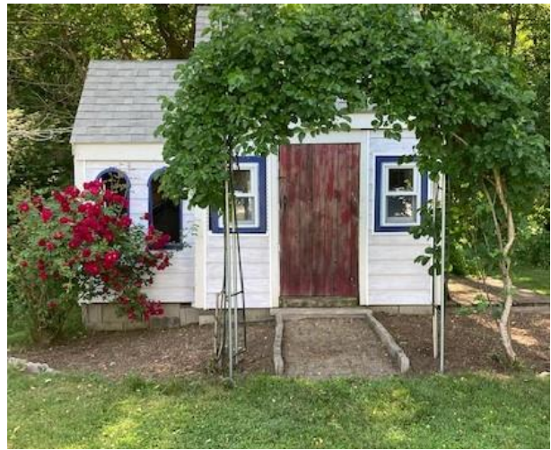
Playhouse conversion to henhouse. Any effort that helps communities become more self-reliant, no matter how small, is a good effort.

with their kids and life, etc. Speaking of homes, they are unaffordable to many people. There will be a commercial real estate crash facing society. Seems like an opportunity to quickly create more housing units by converting existing commercial buildings into housing. What can be done to promote more sustainable housing options in general? There are plenty of people that could provide more targeted assistance, especially if the various groups in the region focused on the environment and people's well-being joined forces to create a larger movement.