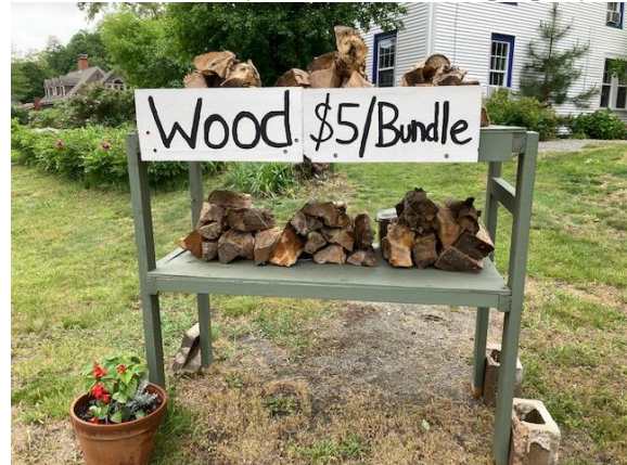
Pictured above: surplus wood to help pay for this newsletter

time by continually stealing from the future to prop up our broken system. Basically, every segment of our economy is being artificially propped up with massive stimulus because it is the only way to keep things running. Our system has developed too many bugs and viruses via the omnipresent destructive force of monopolistic power in our economy and politics. The market and capitalism, as well as democracy does not function properly anymore.