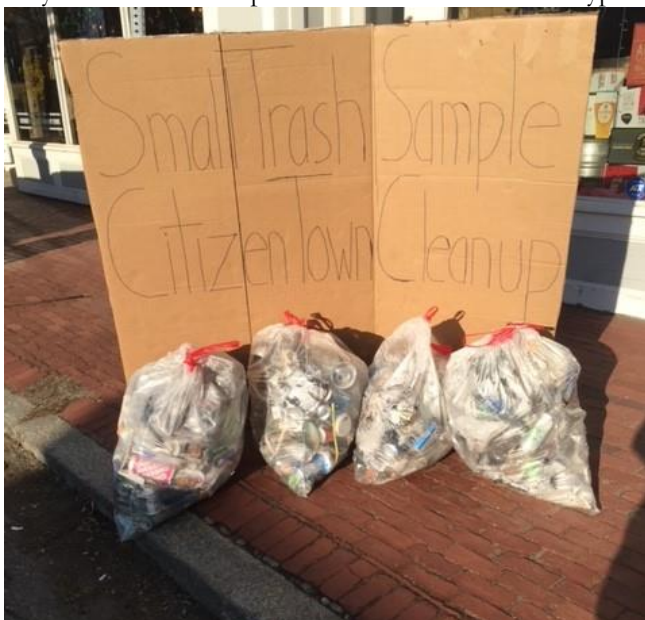
Downtown Amesbury Infrastructure/Trash Protest

Fighting climate change and communities taking back local control are one in the same. Well, here we are, as Newburyport is clearly at a crossroads, with the community's local control completely under siege. When people stand up to powerful entities, the fake nice façade comes off and their true colors show when the pressures get turned up. It is all so unbelievably predictable. We now see who truly is in control behind the scenes in Newburyport. It is great to see efforts such as Extinction Rebellion gaining a foothold locally. Perhaps Extinction Rebellion could expand their protests by helping lead boycotts of these corporate institutions in Newburyport.