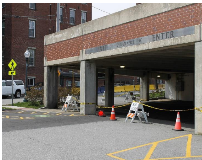
Classic case of neglected infrastructure in downtown Amesbury

Amesbury is a perfect example of the hollowing out trend. Yes, efforts have been made to maintain the charm of downtown; however, the longer-term trend is clear, aided by deliberate leadership decision-making. With one horrible decision, not only is Amesbury abandoning a classic and wonderful neighborhood elementary school location in easy walking distance, the new school location defaces and irretrievably harms the community's most beloved open space. There is so much collateral damage and other negative impacts from this decision that an entire newsletter issue could be focused on this single short-sighted decision. It could be a planning degree case study warning. Still, no one should be surprised, as this is the way the community operates. It won't be long before there is a major push by the convenience crowd to move Town Hall, the library, police station, and fire department out of downtown.