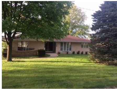
One of Stanton's finest homes: 601 Center St., Stanton, IA 51573

509 Main St PO Box 745 Griswold, IA 51535 Phone: (712) 778-2242 Fax: (712) 778-2243 Email: Bergrenre@netins.net www.bergrenrealestateandauction.com