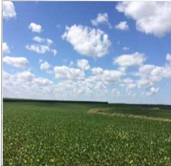
Soils data provided by USDA and NRCS.