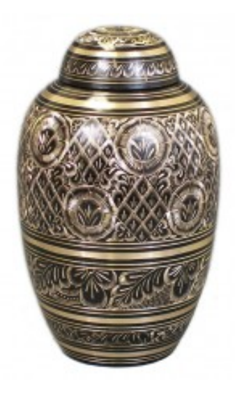
Black Etched Gajmoti #99025 11" x 5"