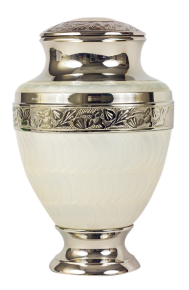
Mother of Pearl Gravure Craft #UR-1734 10" x 6"