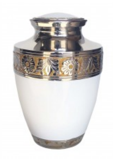
Country Floral Gajmoti #99140 11" x 5"