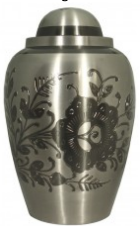
Brass Antiqued Finish Gajmoti #99110 11" x 5"