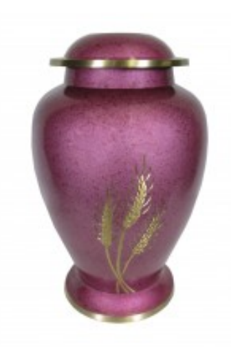
Brass Pink Gajmoti #99141 11" x 5"