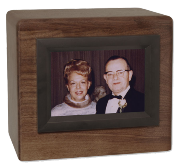
Photo Companion Walnut or Oak Gravure Craft #UR-6003/6002 11" x 9" x 8"

Lovebird Companion Gravure Craft #UR-6001 10" x 9" x 10"