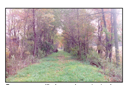
Greenways will play an important role in connecting existing parks in Central Lancaster County.

In addition to public input, several plans were reviewed in the preparation of this chapter, including the Lancaster County Plan from 1992 and the LIMC Regional Park and Open Space Plan from 1993. All of the 11 municipalities have addressed parks and recreation within their own comprehensive plans or park and open space plans; these plans have also been incorporated into this review. In addition, the 1999 Conestoga Greenways Plan was consulted to obtain information about existing and proposed parks and greenways in the Central Lancaster County region.