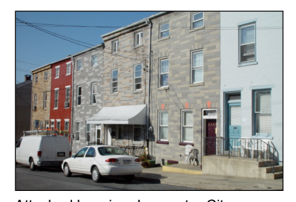
Attached housing, Lancaster City.

Certain housing development tools that can contribute to housing diversity are recommended in a number of the plans. Permitting higher