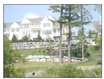
Mills Creek, a traditional neighborhood development.