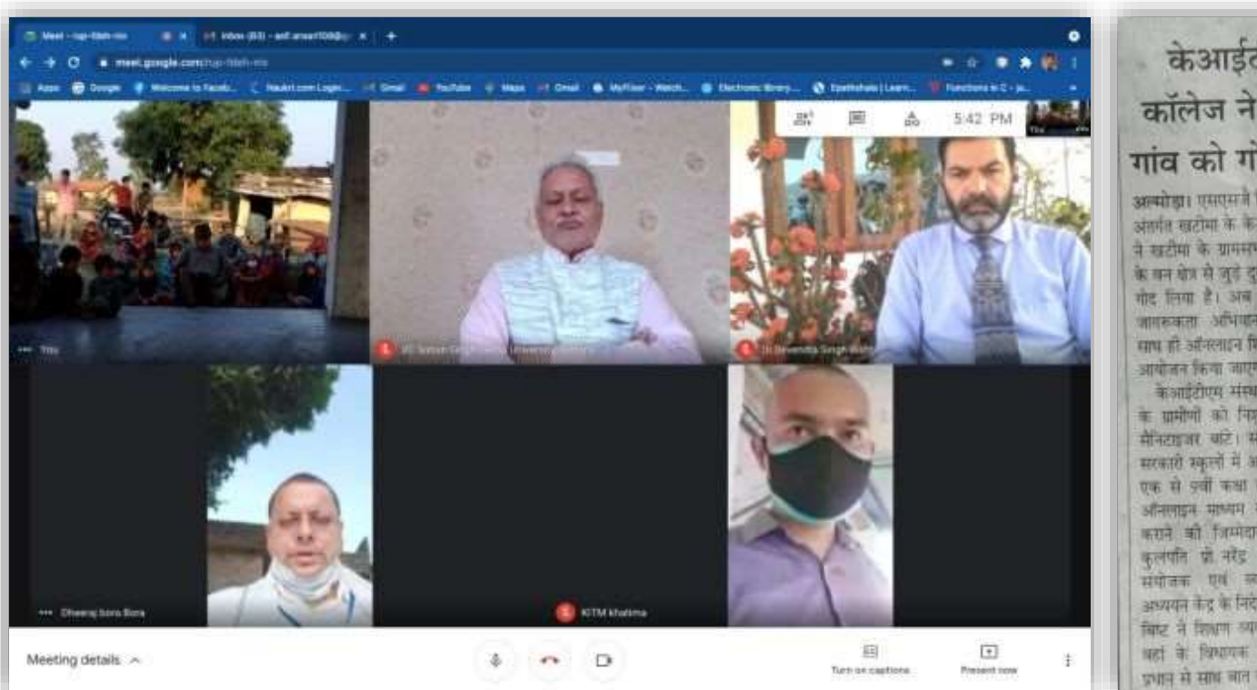
केआईटीएम कॉलेज ने दुगाड़ी गांव को गोद लिया

It was directed by the Honorable Vice Chancellor to adopt backward villages deprived of health, education and basic facilities. We adopted Dugadi Goth, a village in Khatima, along with the Honorable Chief Minister. We did the work of providing protein-rich food to malnourished children, sanitizers, masks to prevent corona, and education to young children from time to time.