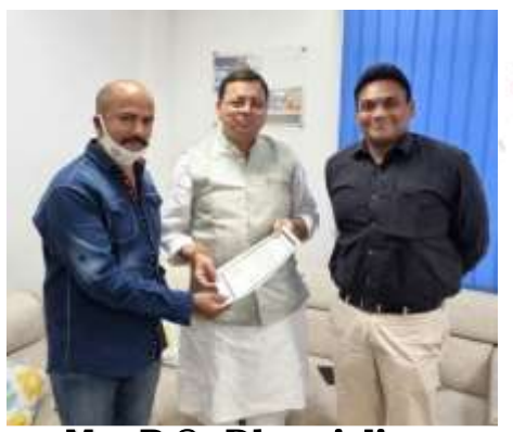
Mr. P.S. Dhami Ji Hon'ble Chief Minister, Uttarakhand