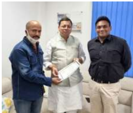
Mr. P.S. Dhami Ji Hon'ble Chief Minister, Uttarakhand