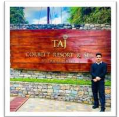
KITM Student get promotion