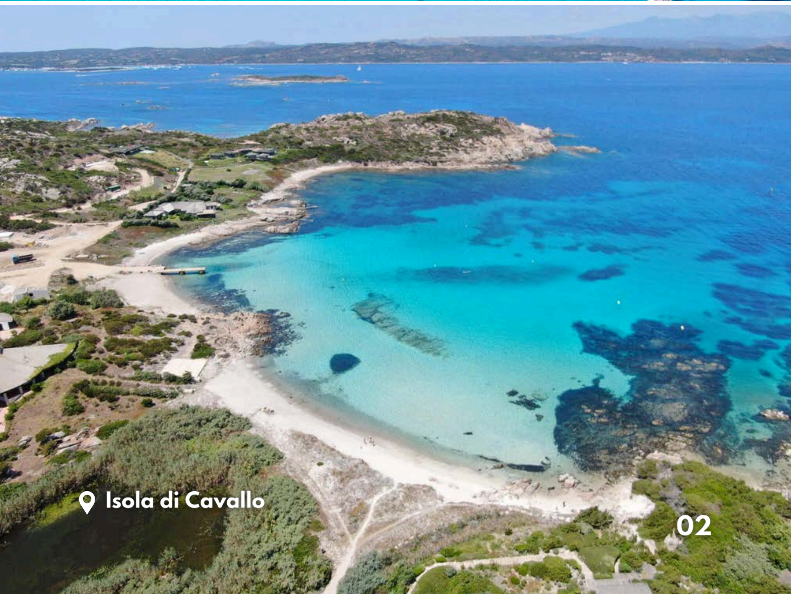
📍 Isola di Cavallo