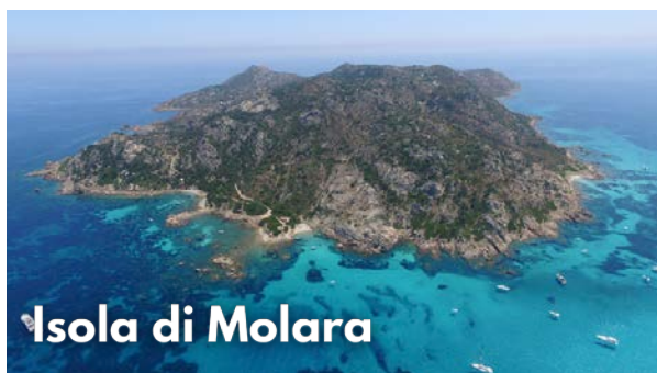
Isola di Molara