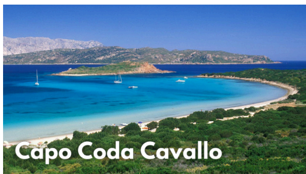
Capo Coda Cavallo