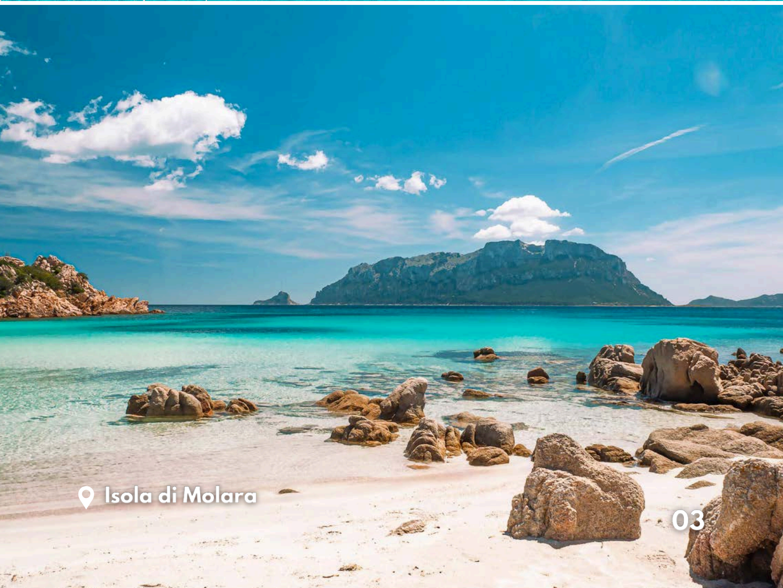
📍 Isola di Molara