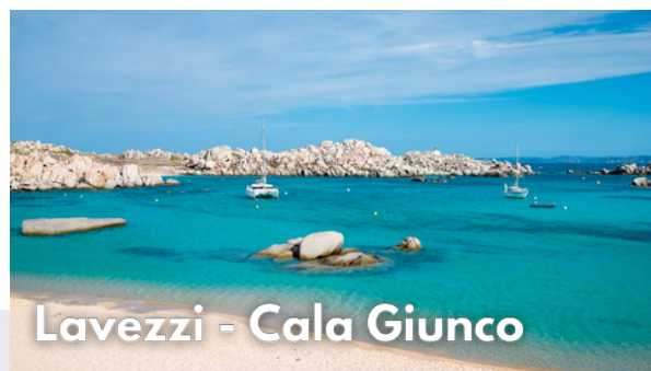
Lavezzi - Cala Giunco