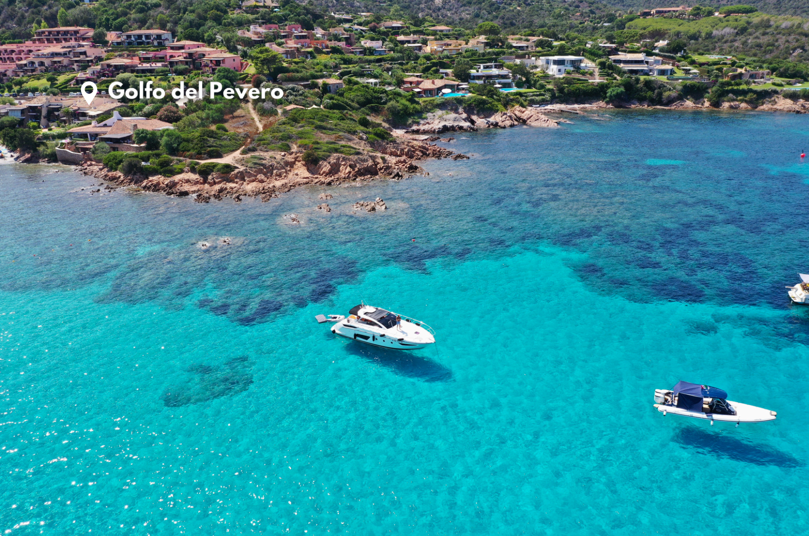
📍 Golfo del Pevero