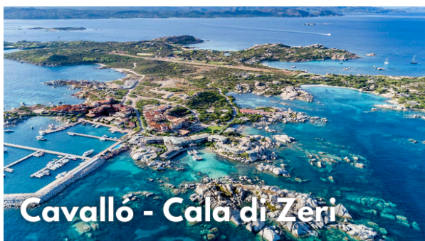
Cavalló - Cala di Zeri