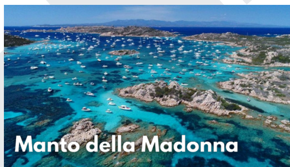
Manto della Madonna