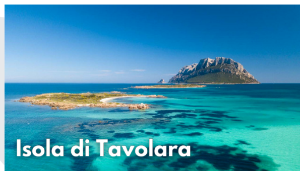
Isola di Tavolara