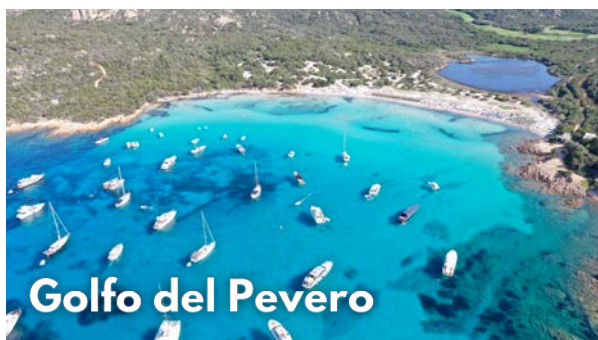
Golfo del Pevero