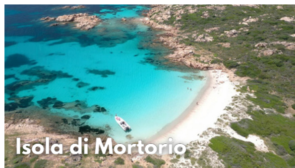
Isola di Mortorio