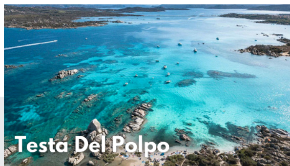
Testa Del Polpo