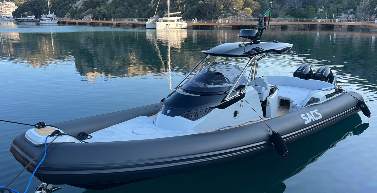
SACS MARINE - STRIDER 11