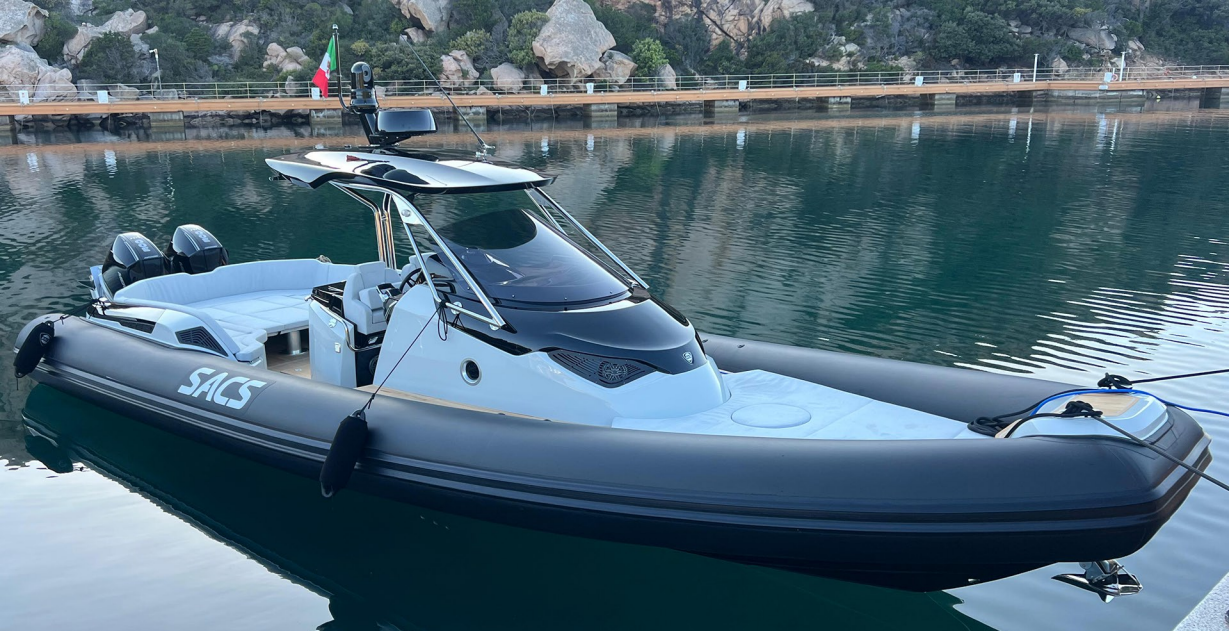
SACS MARINE - STRIDER 11