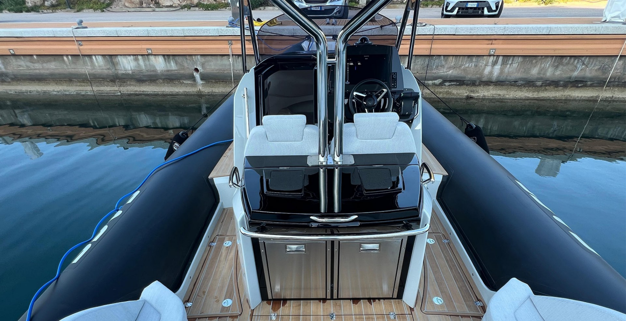
SACS MARINE - STRIDER 11