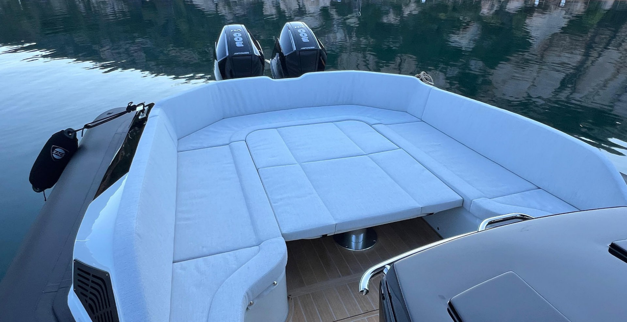
SACS MARINE - STRIDER 11