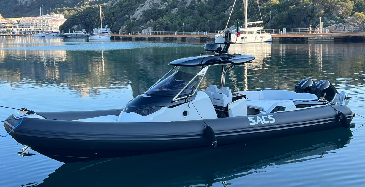
SACS MARINE - STRIDER 11