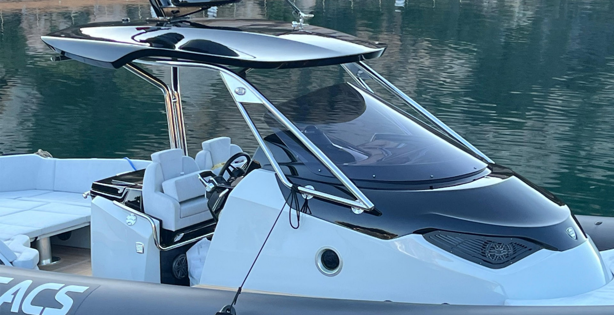
SACS MARINE - STRIDER 11