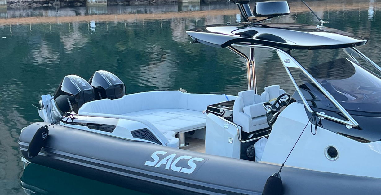
SACS MARINE - STRIDER 11