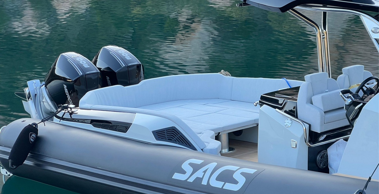
SACS MARINE - STRIDER 11