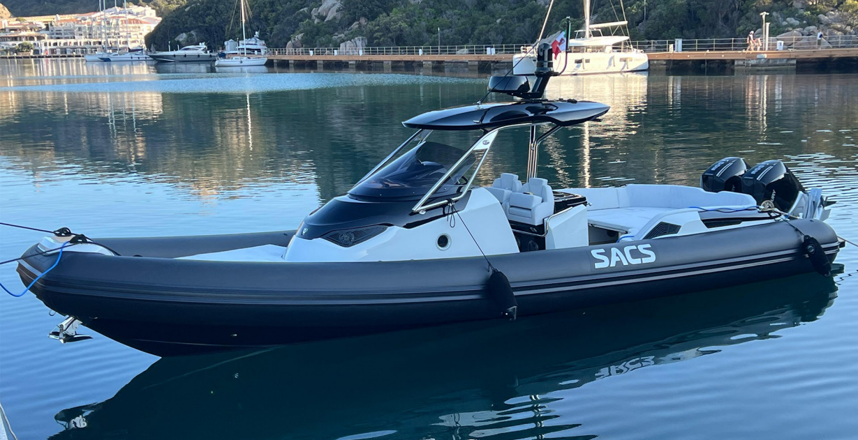
SACS MARINE - STRIDER 11