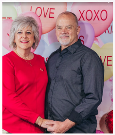
38 Years of Marriage

We can't wait to gather again next year. ❤️