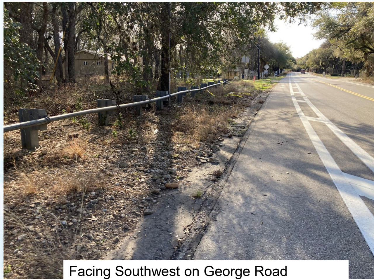
Facing Southwest on George Road