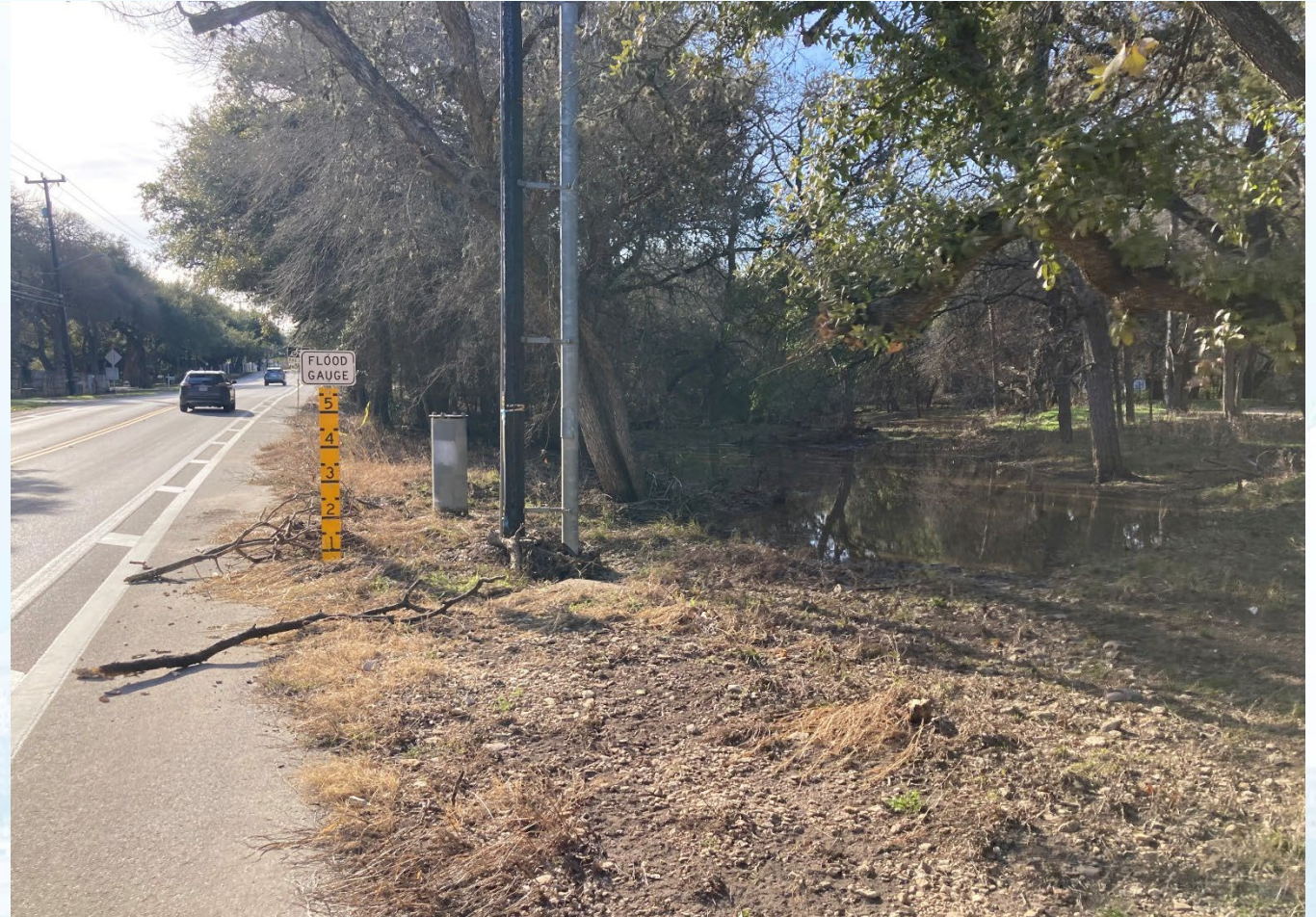
Facing Southwest on George Road – Upstream View