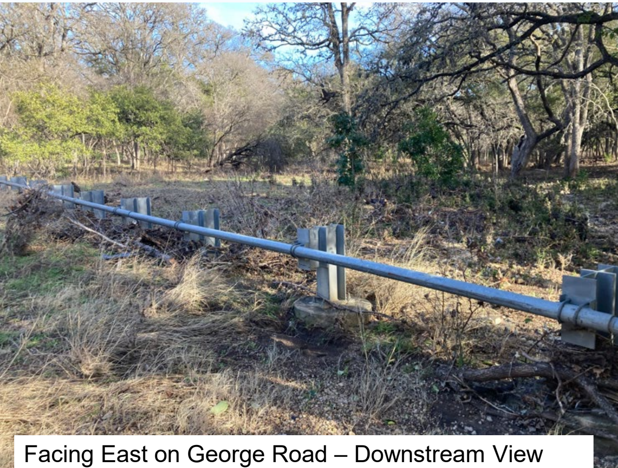
Facing East on George Road – Downstream View