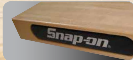
Maple Hardwood Top