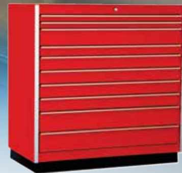
Single Bank, 10 Drawers

Width: ..... 35.63" Height: ..... 56.34" Depth: ..... 29.09"