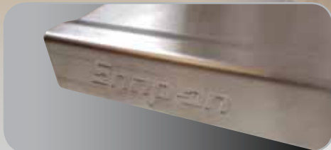
Stainless Steel Top