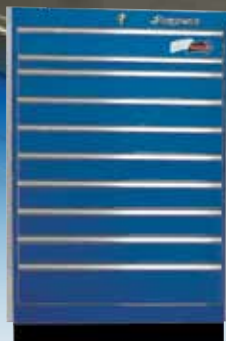
Single Bank, 10 Drawers

Width: ..... 35.63" Height: ..... 43.03" Depth: ..... 29.09"