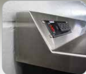
Integrated Electrical Outlet / Data Ports