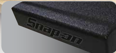
New! Bedliner Coated Steel Top Impervious to chemicals