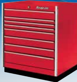
Single Bank, 8 Drawers

Width: ..... 35.63" Height: ..... 38.85" Depth: ..... 24"