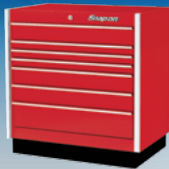
Single Bank, 7 Drawers

Your custom design starts with these popular building blocks.