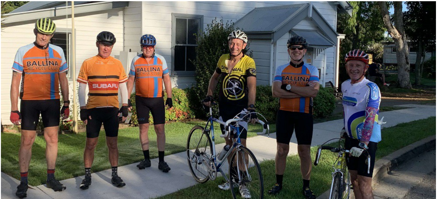
When we got back to Ballina, we were keen to refresh ourselves at the Green Coast Cafe.