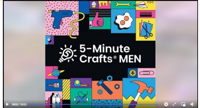
Easy bicycle maintenance tips for smart riders