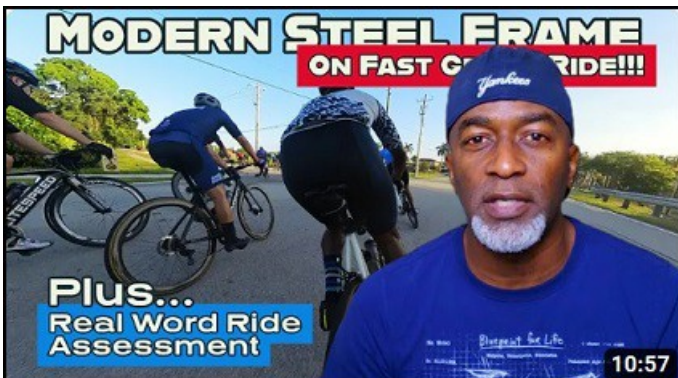
Modern Steel Bike Frame Tested: Does it measure up to Carbon?