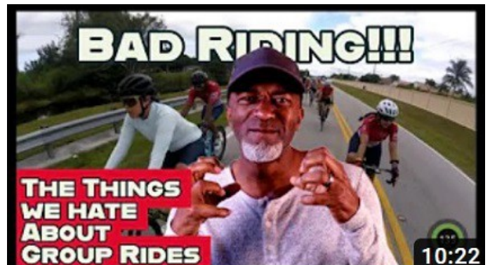
The Unexpected Reason Cyclists Avoid Group Rides