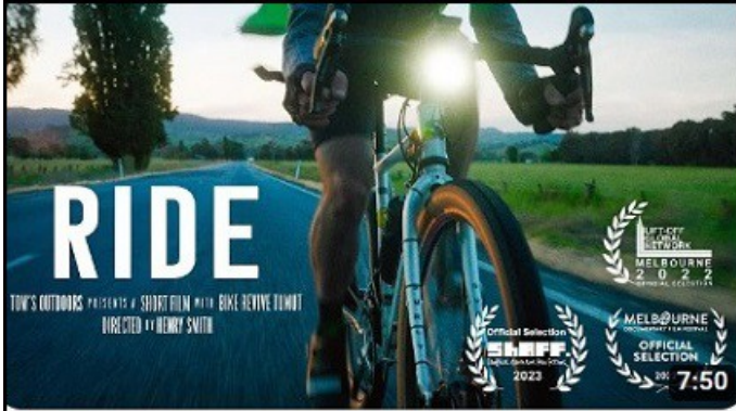
Ride: A Short Film About Cycling