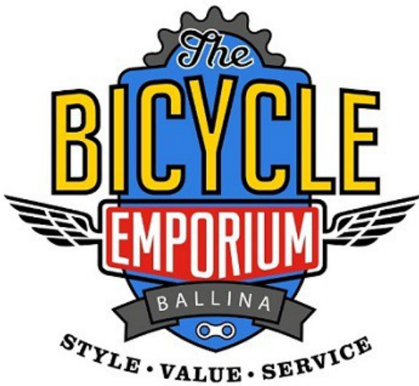
THE BICYCLE EMPORIUM 158 River Street Ballina http://thebicycleemporium.com.au/index.html