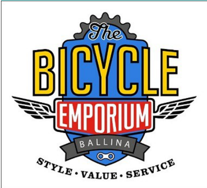
THE BICYCLE EMPORIUM 158 River Street Ballina http://thebicycleemporium.com.au/index.html