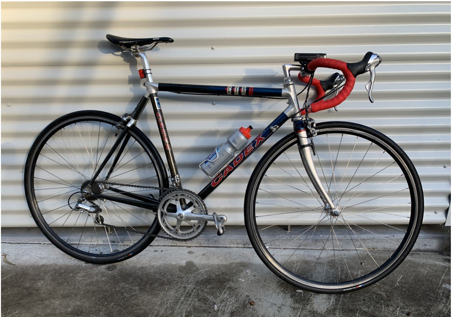
Simon's bike for the day.