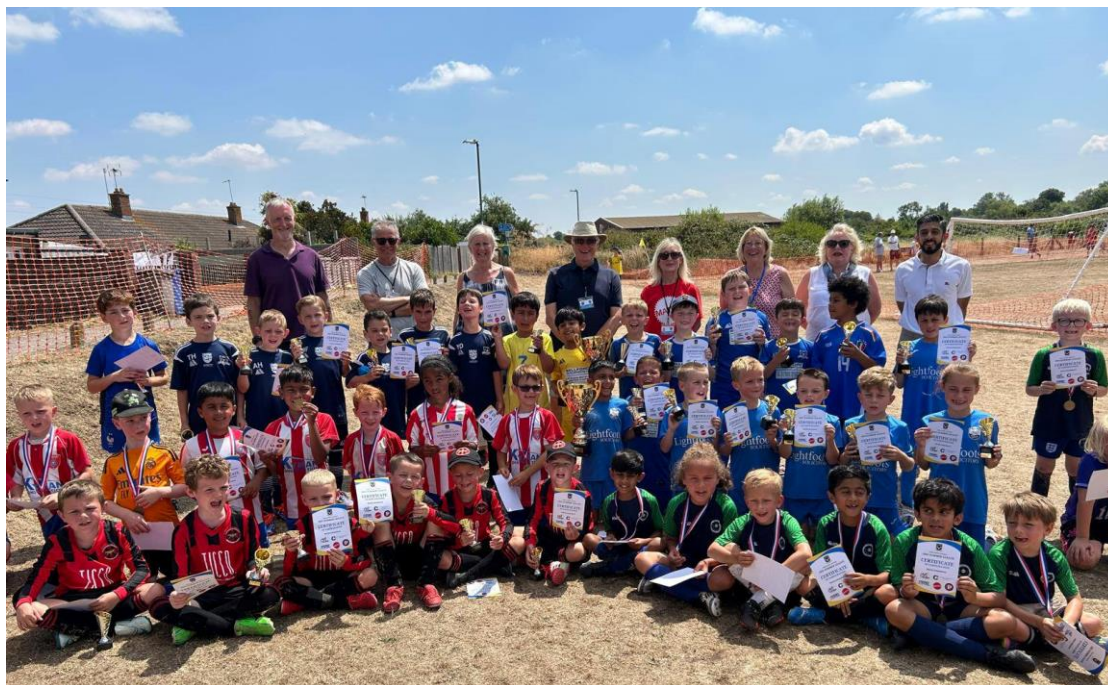
Photo from the final day of the Eton Town Council junior football league at Haywards Mead, Eton Wick.

Printed copies of this newsletter are available from the Village Pharmacy, the Corner Café, Hair by Us, Eton Wick Football & Social Club, the Village Hall foyer, and the Library.