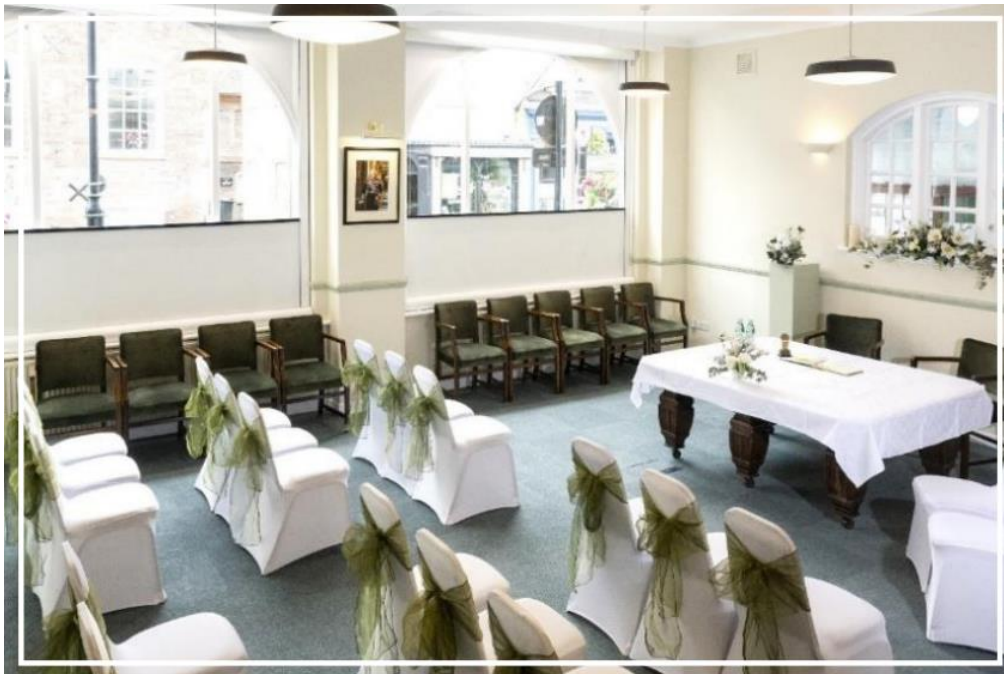
Eton Town Council Chamber – now a licensed wedding venue