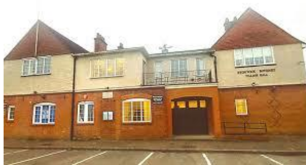
Eton Wick Village Hall

We are so lucky to have a wonderful village hall. It is used during weekdays by a variety of groups, bowls, keep fit, yoga, dance, karate etc.