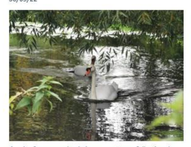
A pair of swans make their way upstream following the weed clearance on 30/09/22

Residents should have seen the Maydencroft operatives clearing both waterweed and phragmites (AKA 'Norfolk Reeds') from both the Boveney and Roundmoor rivers starting 17<sup>th</sup> October and working for four weeks. Whilst EWWG feel that this should have been done sooner, we look forward to seeing an improvement to flow immediately afterwards and throughout the winter months as a result.