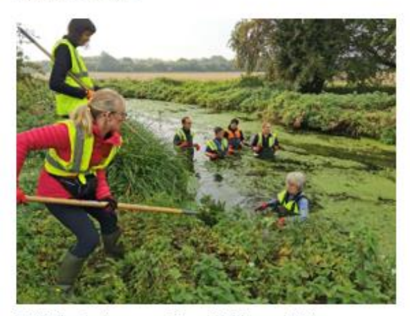
EWWG volunteers working with Thames Water volunteers on the Boveney at Haywards Mead 30/09/22