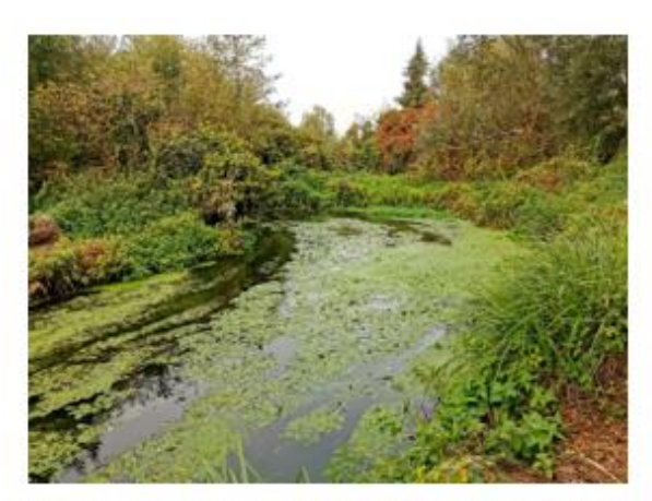
Section of the Boveney at Haywards Mead before weed removal 30/09/22

Water, including two from the project team to carry out a fuller clearance of weed on the Boveney along the entire stretch of the Boveney at Haywards Mead recreation ground. This resulted in a drop in river levels on the Boveney by about 10cm in places and allowed a pair of swans to make their way upstream as soon as it was cleared.