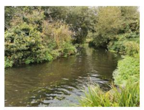
Same Section of the <u>Boveney</u> after weed removal 30/09/22