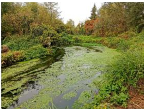
Section of the Boveney at Haywards Mead before weed removal 30/09/22

Water, including two from the project team to carry out a fuller clearance of weed on the Boveney along the entire stretch of the Boveney at Haywards Mead recreation ground. This resulted in a drop in river levels on the Boveney by about 10cm in places and allowed a pair of swans to make their way upstream as soon as it was cleared.