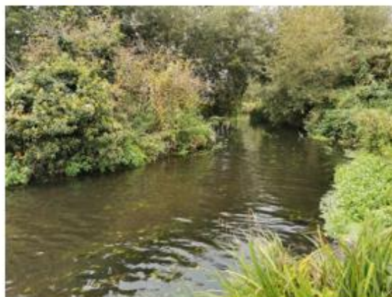
Same Section of the Boveney after weed removal 30/09/22