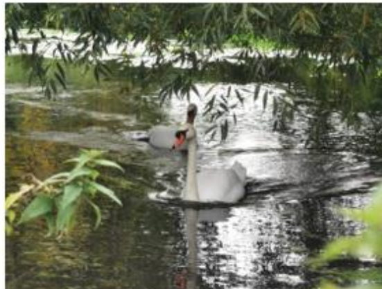
A pair of swans make their way upstream following the weed clearance on 30/09/22

Residents should have seen the Maydencroft operatives clearing both waterweed and phragmites (AKA 'Norfolk Reeds') from both the Boveney and Roundmoor rivers starting 17 th October and working for four weeks. Whilst EWWG feel that this should have been done sooner, we look forward to seeing an improvement to flow immediately afterwards and throughout the winter months as a result.