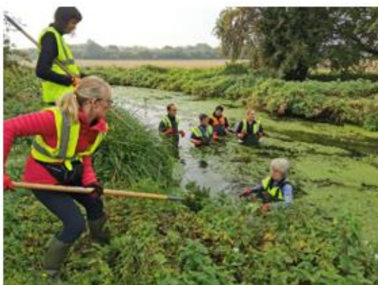
EWVG volunteers working with Thames Water volunteers on the Boveney at Haywards Mead 30/09/22