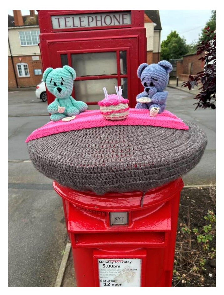
Teddy Bear's Picnic Post-box Topper July 2024