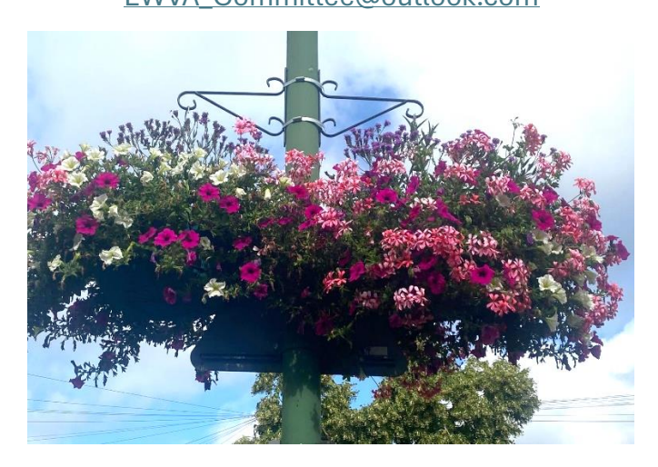
Hanging Baskets on Eton Wick Road

Check out this month's village news, and share your news items with us – EWVA Committee@outlook.com