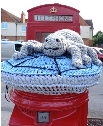
Spider Post-box Topper August 2024