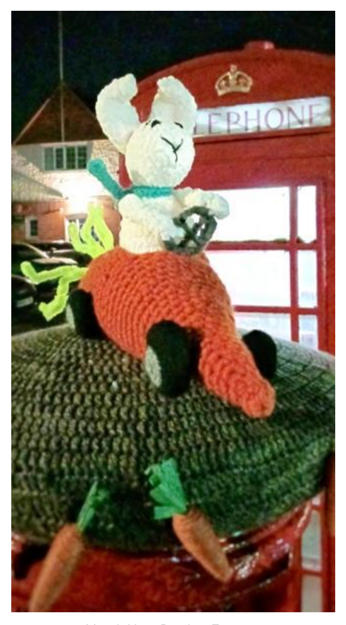
March Hare Postbox Topper