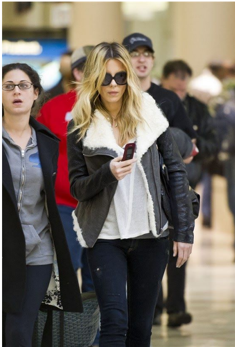
Kate Beckinsale WHISKEY