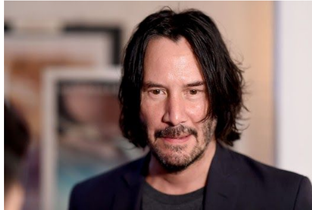
Keanu Reeves WHISKEY'S /EX HUSBAND, DYLAN