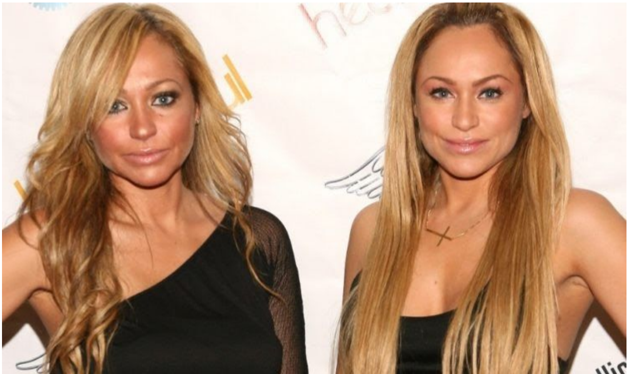
Attached: The Silva Twins as the TIFFANY and EVE