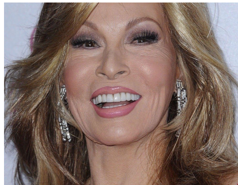
Raquel Welch WHISKEY'S MOM, EVELYN