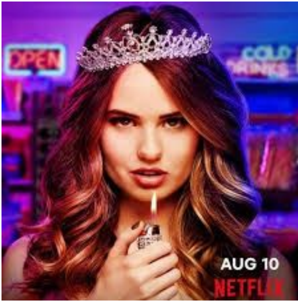
Debby Ryan Young Whiskey