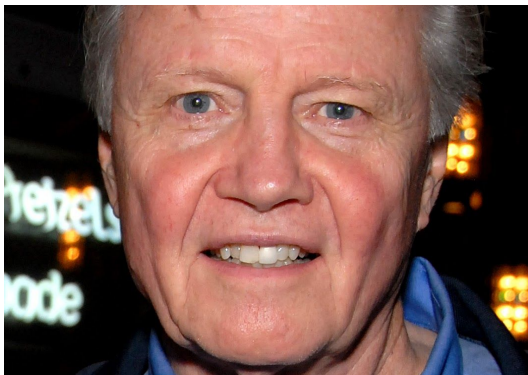
Jon Voight Whiskey's Dad EARL