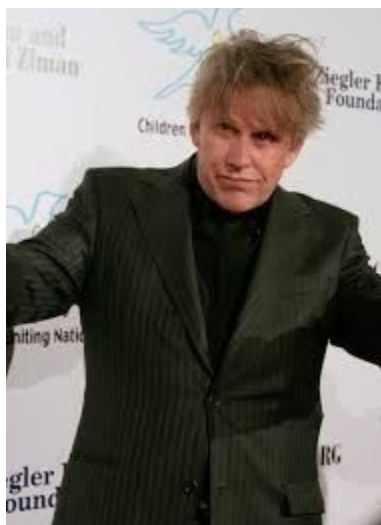
Attached: Gary Busey SELF