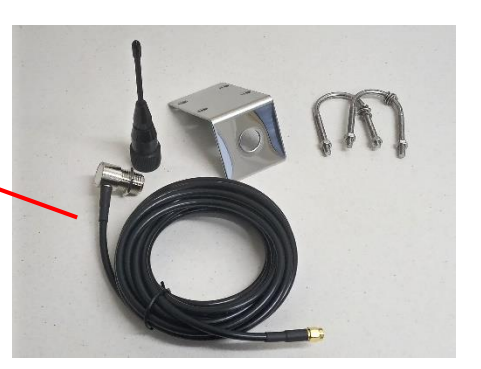
External Antenna - Option B