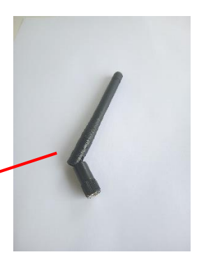
Screw on Antenna - Option A

If using the 11cm internal antenna it can be attached directly to the receiver board SMA (female) connector. This provides fast installation and satisfactory performance for most installations.