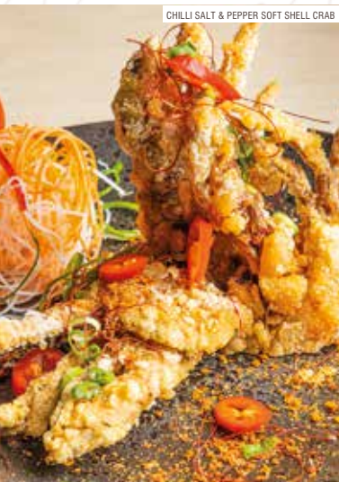
CHILLI SALT & PEPPER SOFT SHELL CRAB