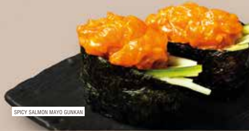
SPICY SALMON MAYO GUNKAN