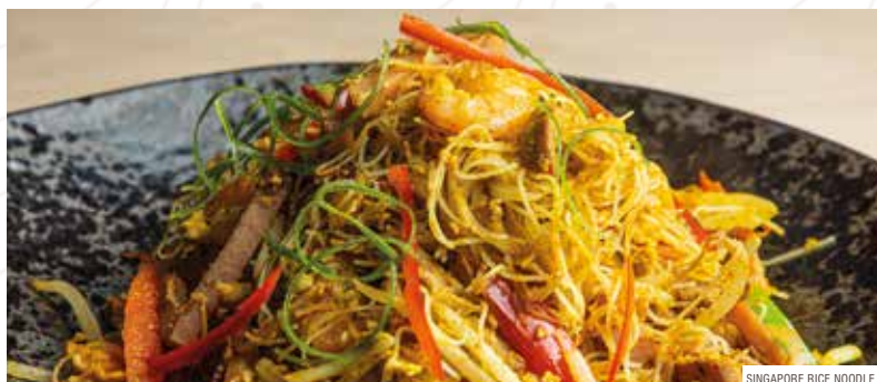
SINGAPORE RICE NOODLE