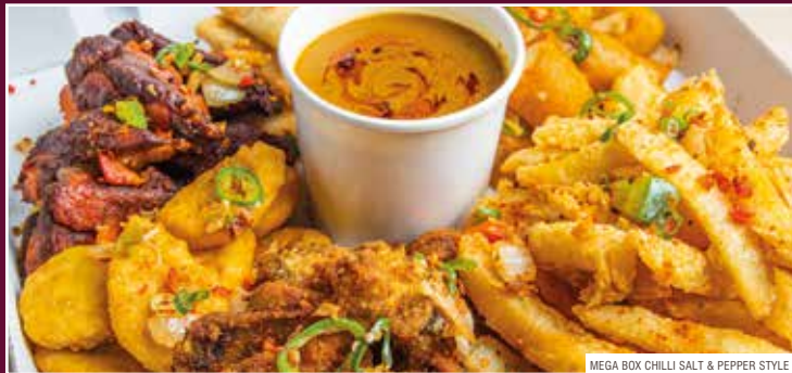
MEGA BOX CHILLI SALT & PEPPER STYLE

[+£1.20 extra for BBQ, Peking or Satay Sauce 🍛🌿]