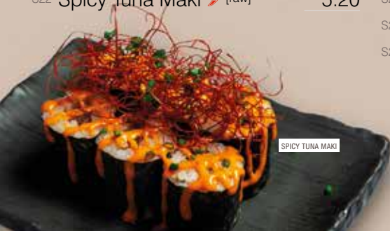
SPICY TUNA MAKI