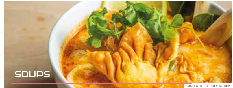
CRISPY WON TON TOM YUM SOUP