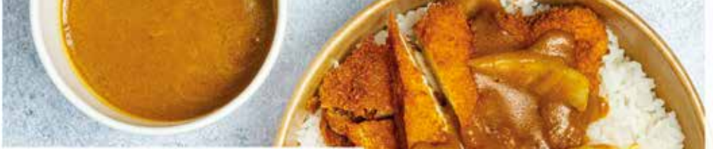
KATSU CHICKEN CURRY