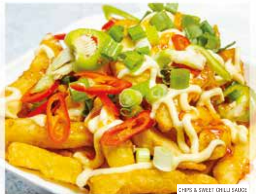
CHIPS & SWEET CHILLI SAUCE