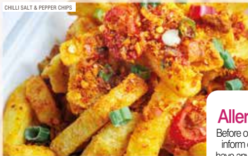
CHILLI SALT & PEPPER CHIPS