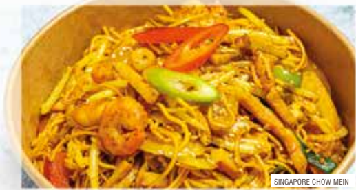
SINGAPORE CHOW MEIN