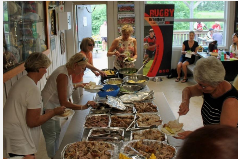
Over-35 Rec. Soccer_AGM_Sep. 21_2018

If we just count on the thumb and little finger, the three shots in the middle don't count right?