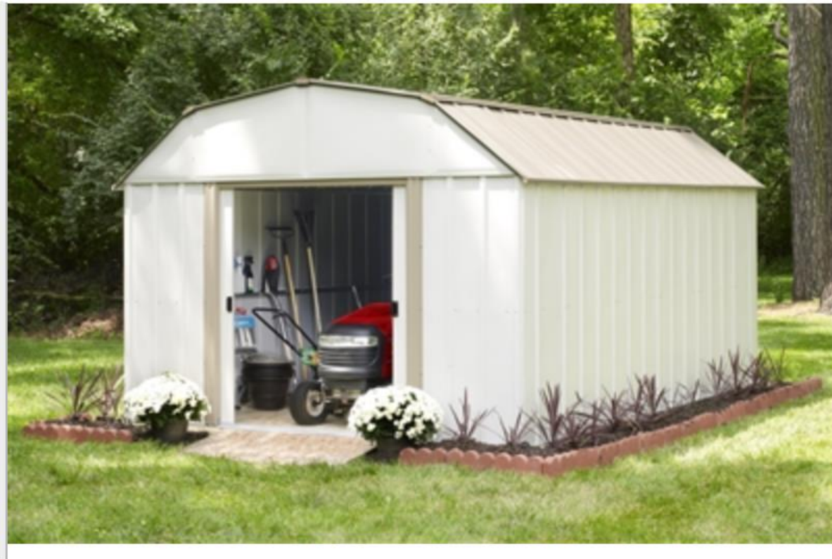
10' x 14' Electro galvanized steel Dakota shed.