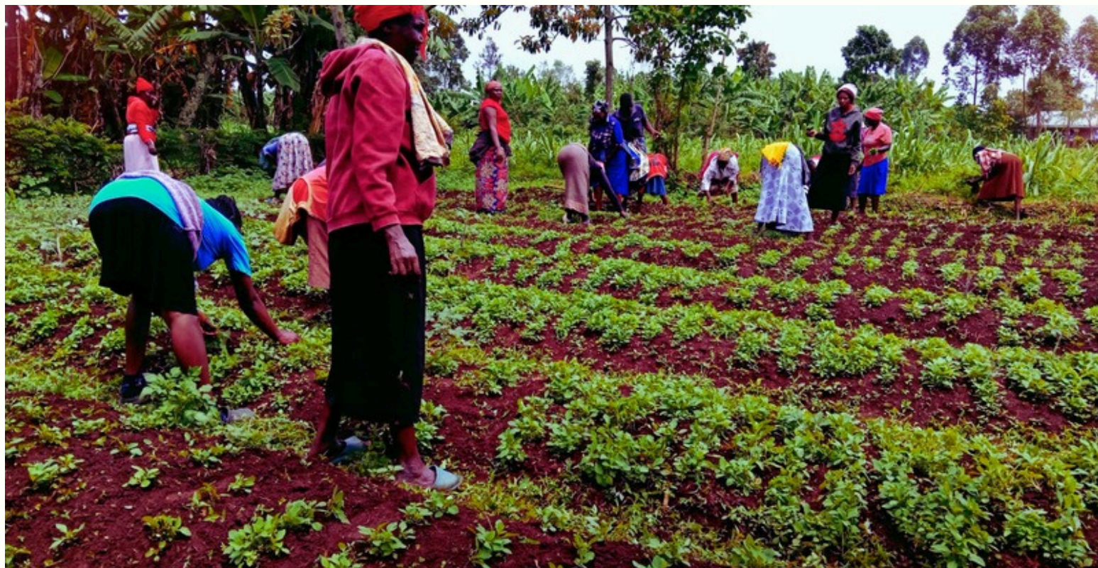
Table Banking in Action: Savings That Spark Growth

As our four newest CHECs prepare to launch their first ventures, table banking is fueling momentum across the wider network—turning weekly savings into real capital for businesses.