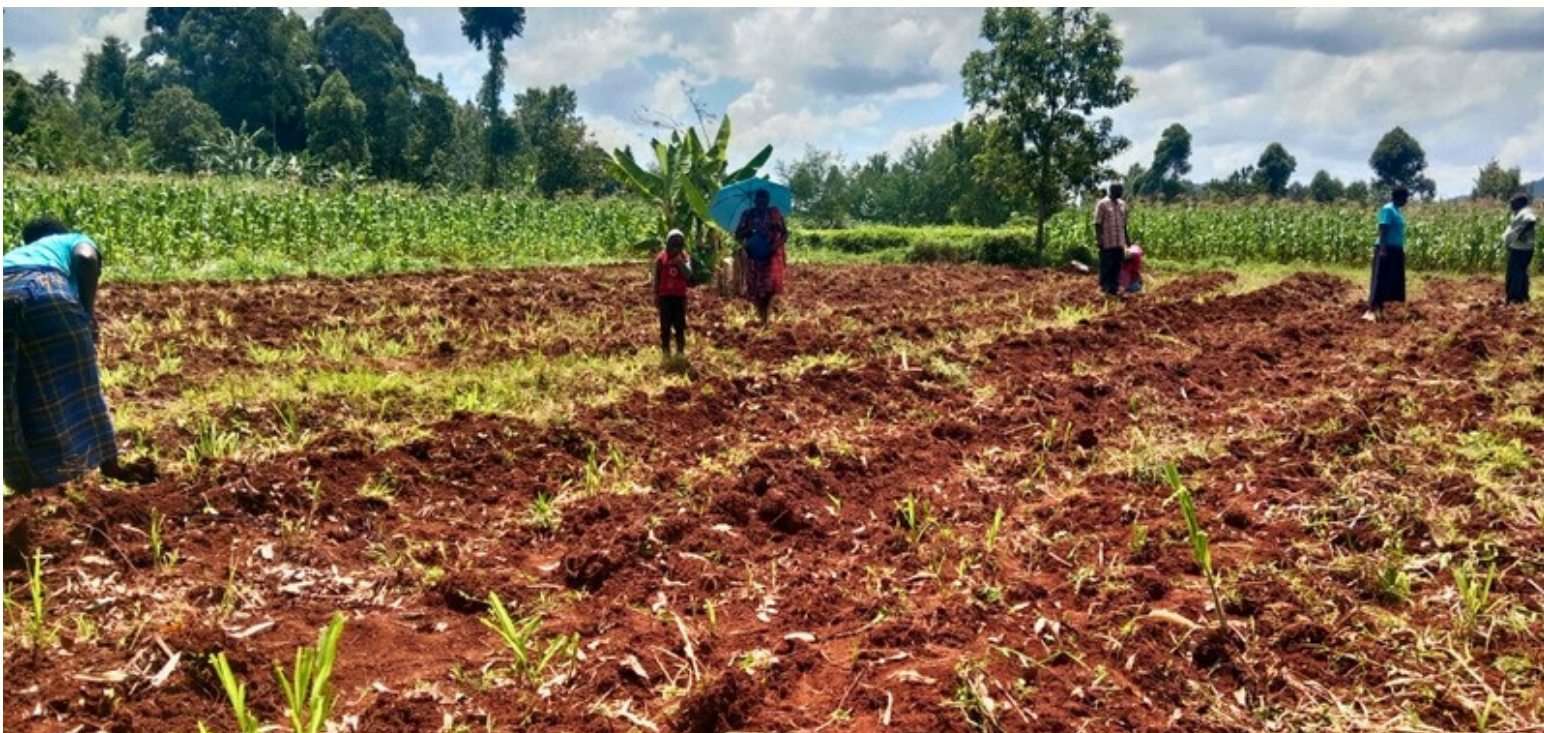
PICTURED ABOVE: NYAMECHEO MEMBERS HARVEST NAPIER GRASS.

This next Global Grant is our biggest step yet toward scaling a model that local communities can own—and carry forward—long after the grant ends.