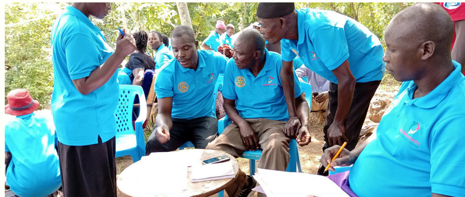
PICTURED ABOVE: MAUGO MEMBERS DISCUSS THE ECONOMICS OF RICE FARMING.