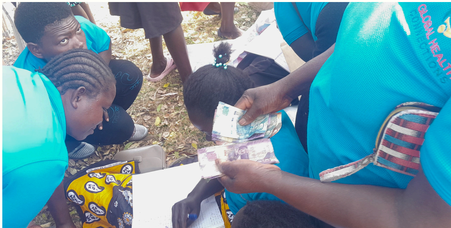
PICTURED ABOVE: A MERRY-GO-ROUND GROUP IN MAUGO POOLING KENYAN SHILLINGS TO DISTRIBUTE AMONG ITS MEMBERS.

As VillageRise gains traction, we're not just scaling a program. We're building a movement rooted in local leadership, data-driven results, and a vision for communities across Africa to rise.