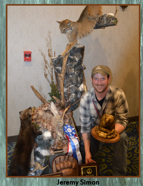
Mounted in Alaska Award Artisan Award Judges Choice Best of Category Masters Habitat Taxidermists Choice Best Habitat