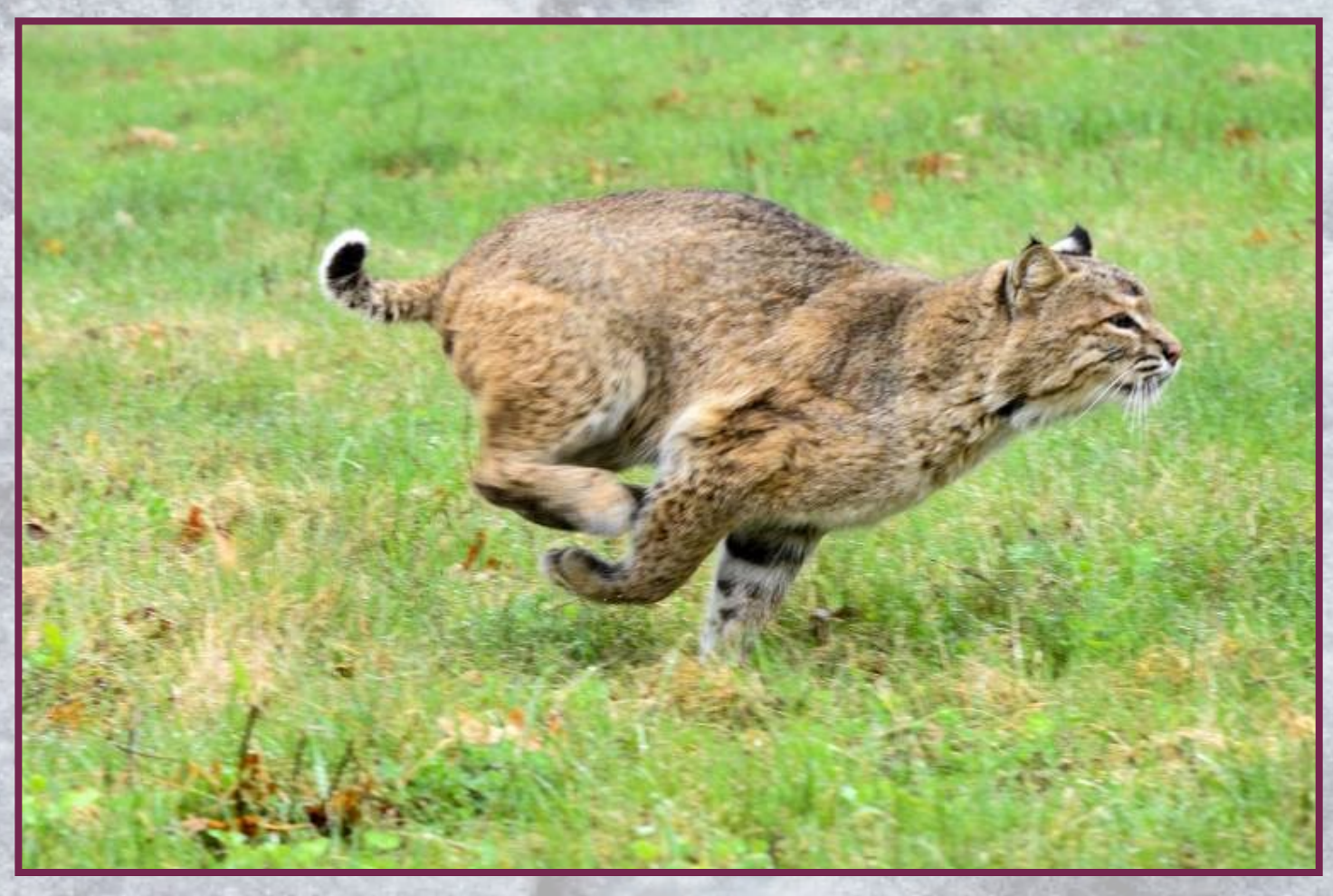
The President's Animal for 2018 Is a life size Bobcat