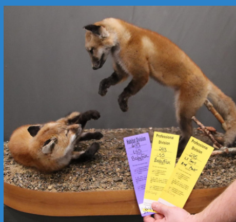
Trina Mallow – WVA Ingles Woodwork