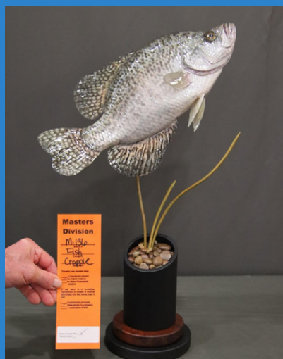
Lance Seal – VA Taxidermist Choice Best Fish