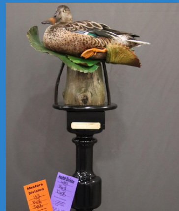
Gerry Viola – VA Golden Example