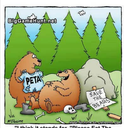
"I think it stands for, "Please Eat The Activist," which is exactly what I did!"