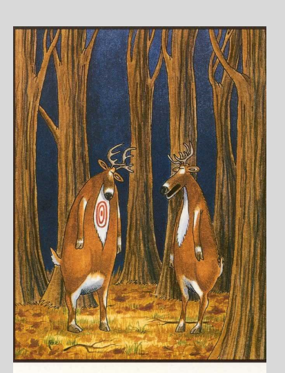
"Bummer of a birthmark, Hal."