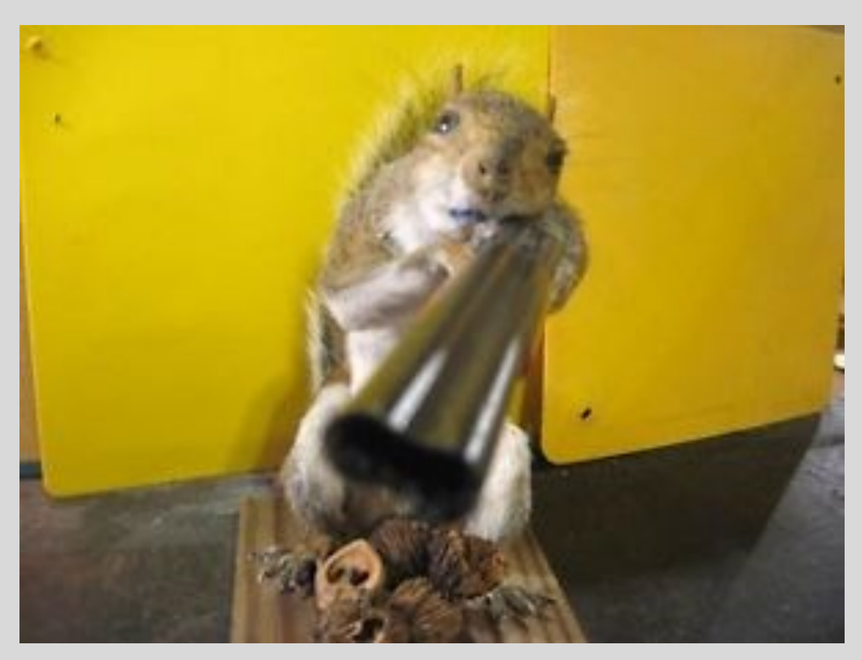
The President's Animal is a squirrel!