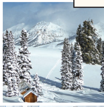
Sun Valley, tracking

East Fork Big Wood River Winter Motorized Use Area