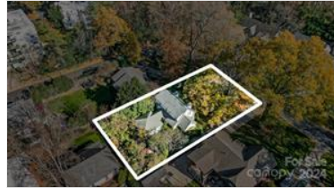
Apx lot lines