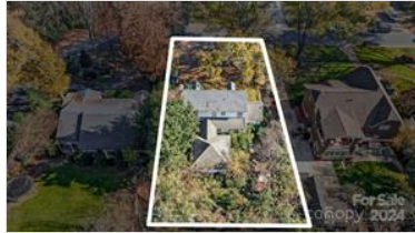
Apx lot lines