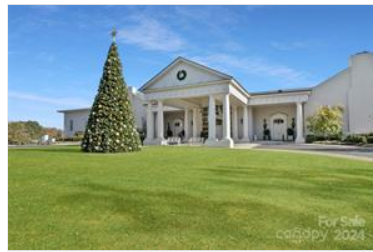
Myers Park Country Club