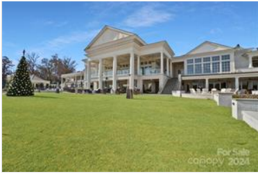
Myers Park Country Club