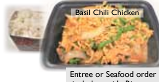
Entree or Seafood order includes a side Rice