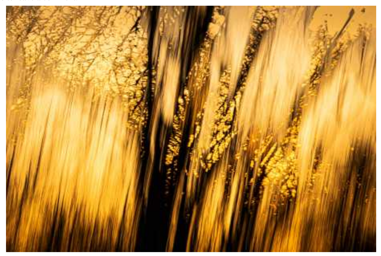
Golden Golden - ICM and ME - f/14; 1/15

Please share my journey at ellenzphoto.com, @ellenzphoto on Instagram, or ellenzphoto on Facebook. And feel free to leave a comment.