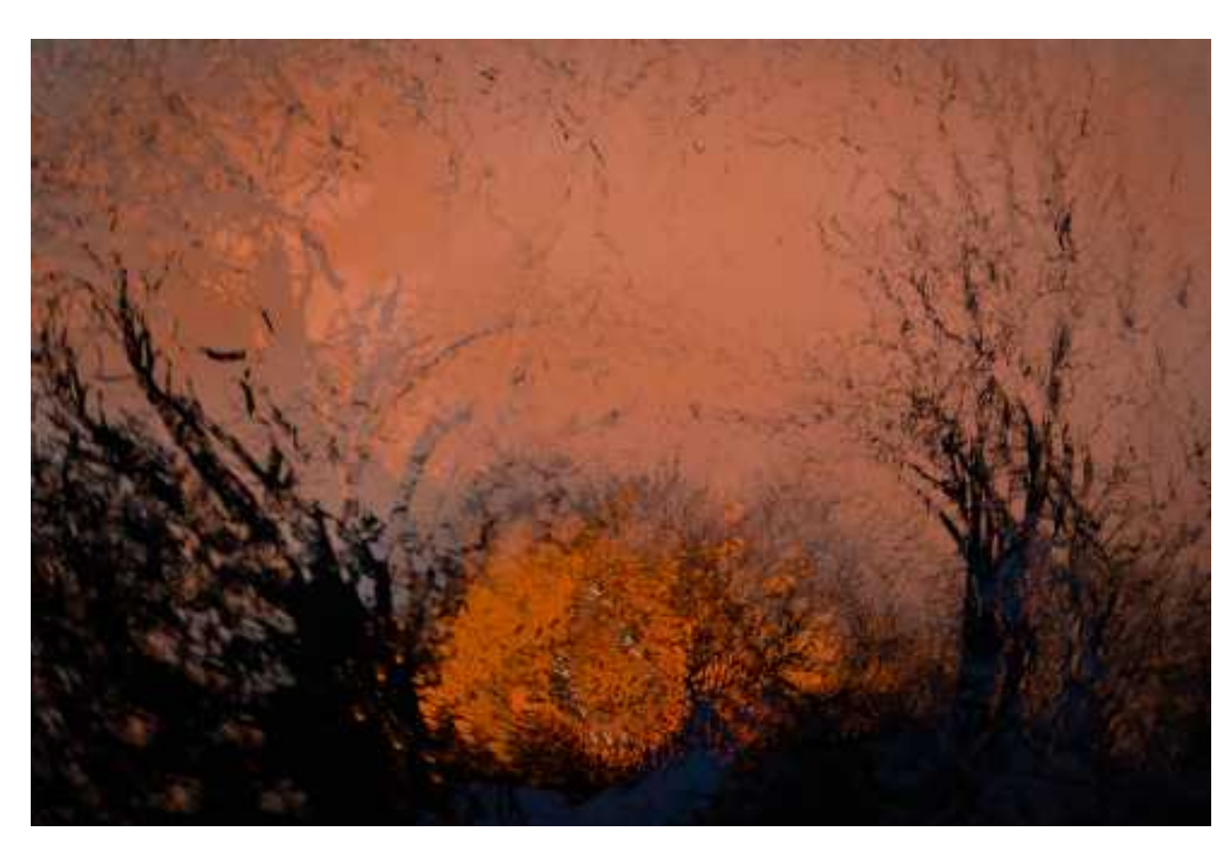
Fairy Land - ICM and ME - f/5; 1/15