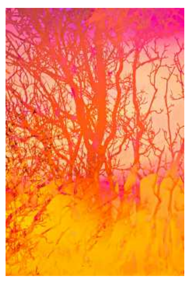
Wonderland - ICM and ME - f/11; 1/15