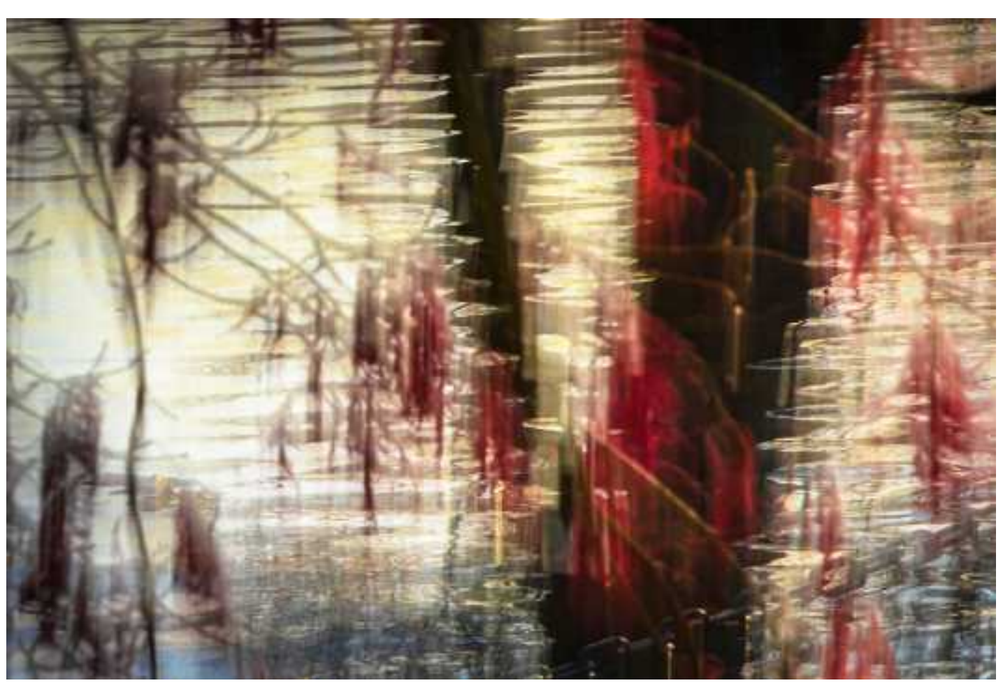
Maple Over Water - manual focus, ICM - f/20, 1/13th