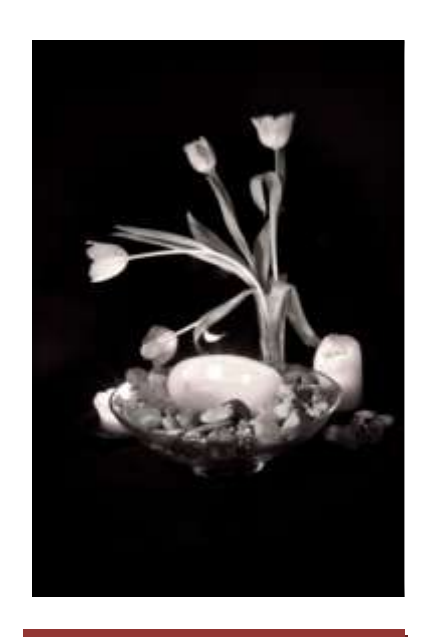
Second Place Light Cathie Carnahan