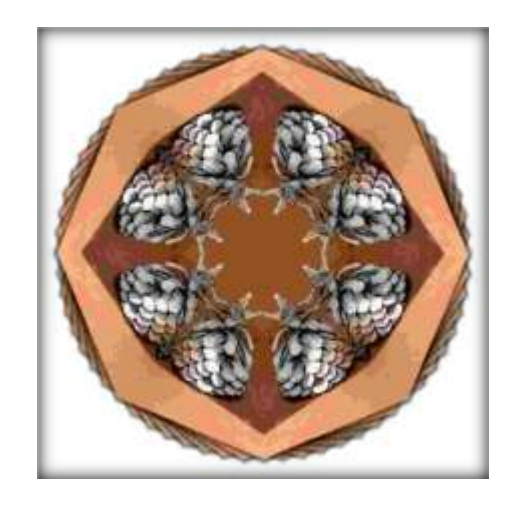
First Place Pine Cone Hold Hands Earl Cockerham