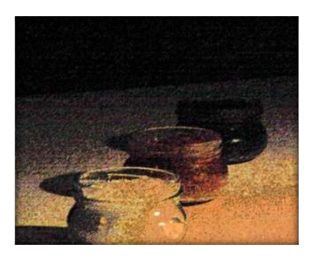
Second Place With a Grain of Salt Ellen Zimmerman