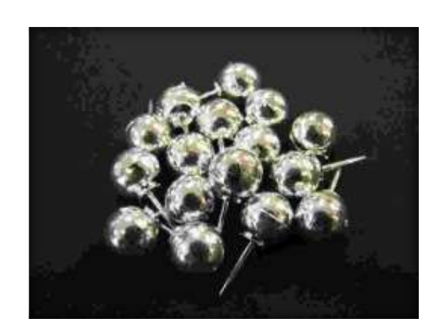
First Place Tacks Earl Cockerham