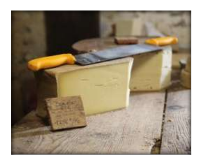
First Place Fromage Lisa Pianalto