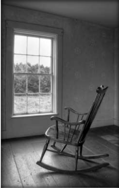
First Place A Place to Watch Rip Smith