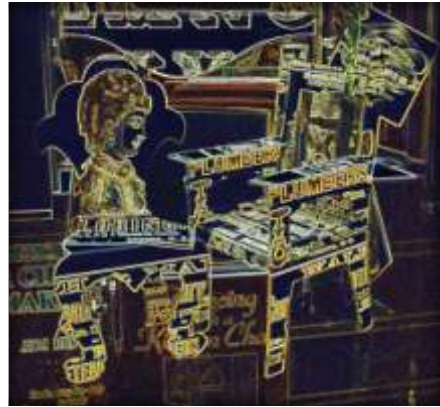
Second Place Night on the Town Kristen Zimet