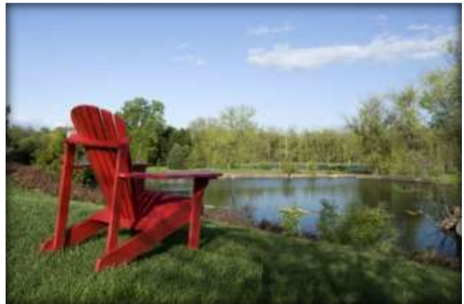
Honorable Mention Waiting Mike Potter