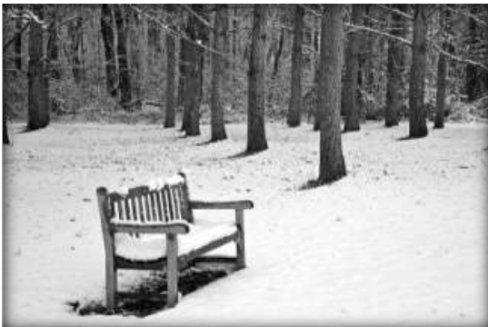
Third Place Waiting for Spring Chet Lewandowski