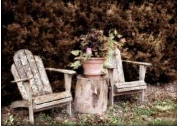
First Place Twilight Cathie Carnahan