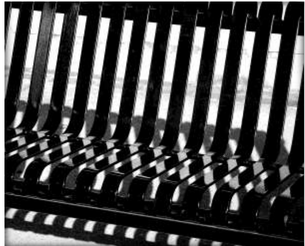
Second Place Lines and Shadows Ellen Zimmerman