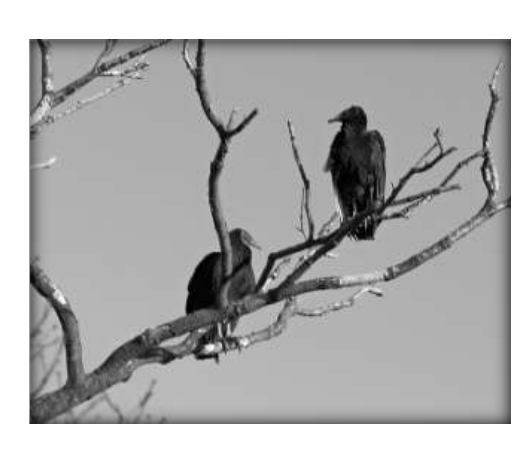
Honorable Mention Vultures Chet Lewandowski