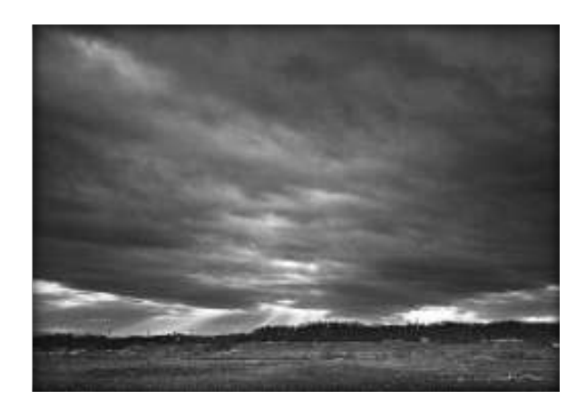
First Place Threatening Clouds Karl Mueller