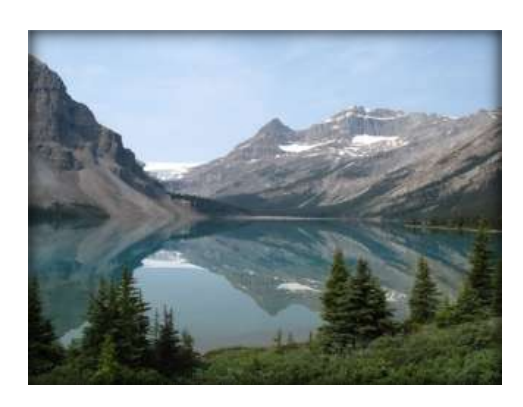
Second Place Bow Reflection Spencer Ridings