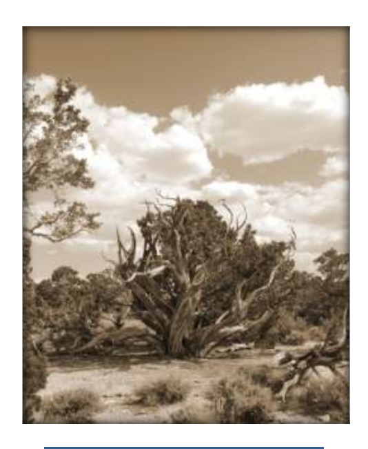
First Place Old West Kelly Moberg