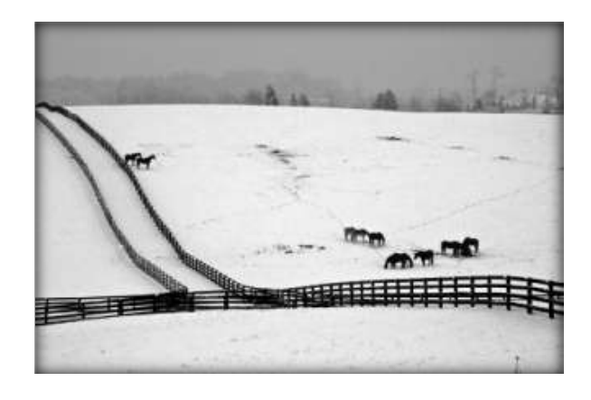
Second Place Snow Grazing Chet Lewandowski