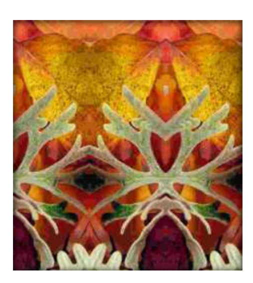
Third Place Leo Leaf Earl Cockerham