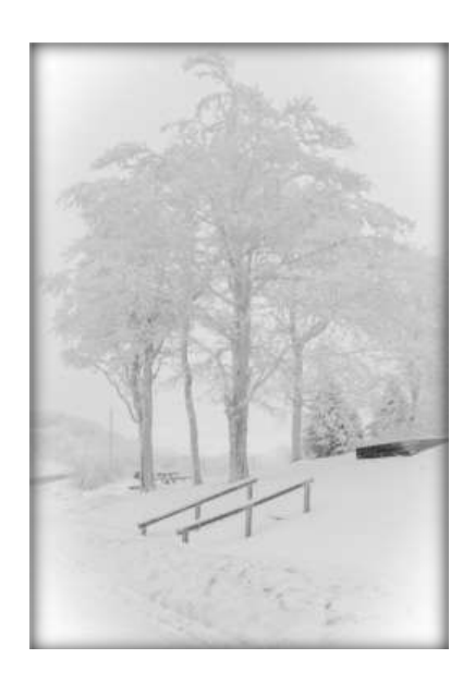
First Place White Out Cathie Carnahan