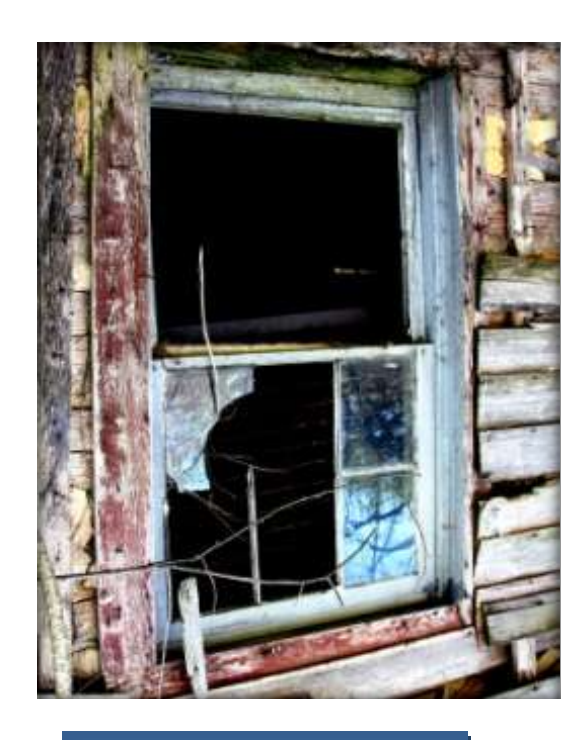
First Place Broken Ellen Zimmerman