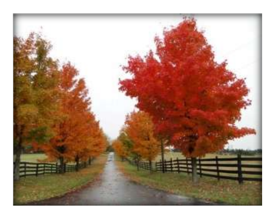
Third Place Autumn Foliage Bill Meeker